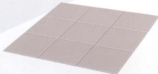
12' x 12' 9 Modules