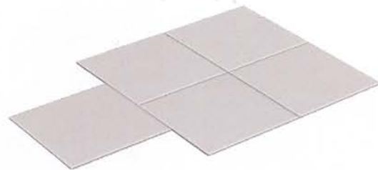
8' x 8' w/ Porch 5 Modules