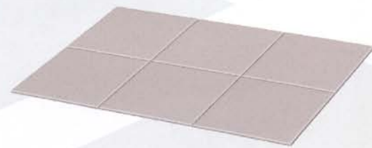
8' x 12' 6 Modules