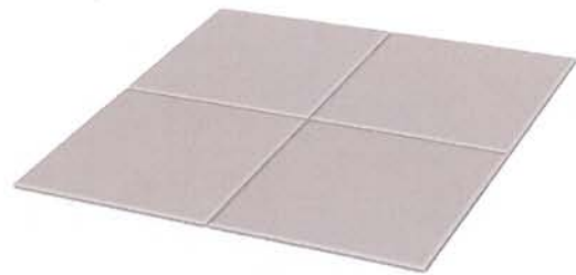
8' x 8' 4 Modules